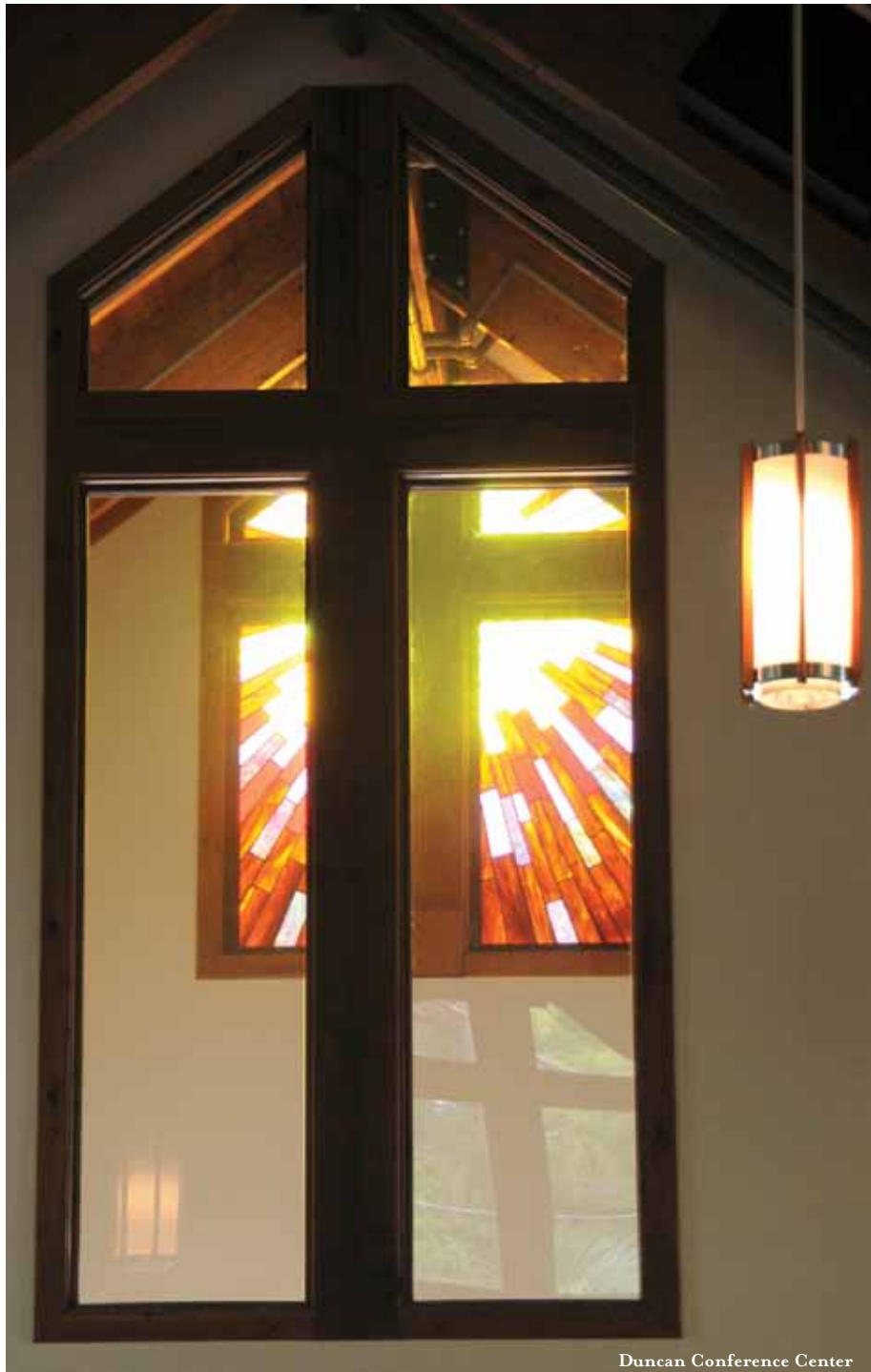
Duncan Conference Center