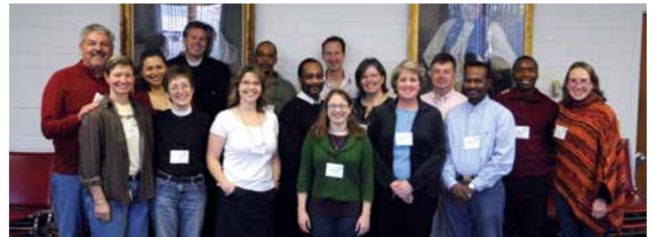
Fresh Start in Michigan