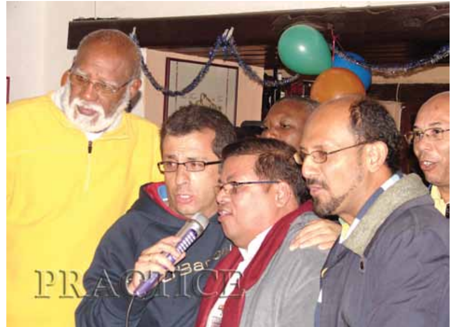
CREDO 187 – Spanish

During the eight days, clergy and lay employees work with an experienced and committed faculty team and test fresh insights within a small peer group. Participants are led to imagine a life of wellness in all its fullness and encouraged to create a CREDO Plan that is a measure of God’s call to their own transformation and their self-efficacy for change.