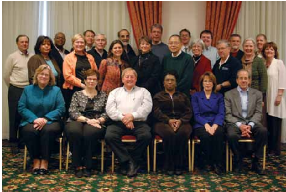
CREDO Advisors and Directors