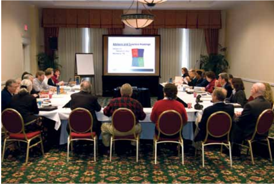
CREDO Advisors and Directors