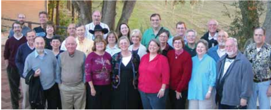
CREDO 192 – Strength for the Journey