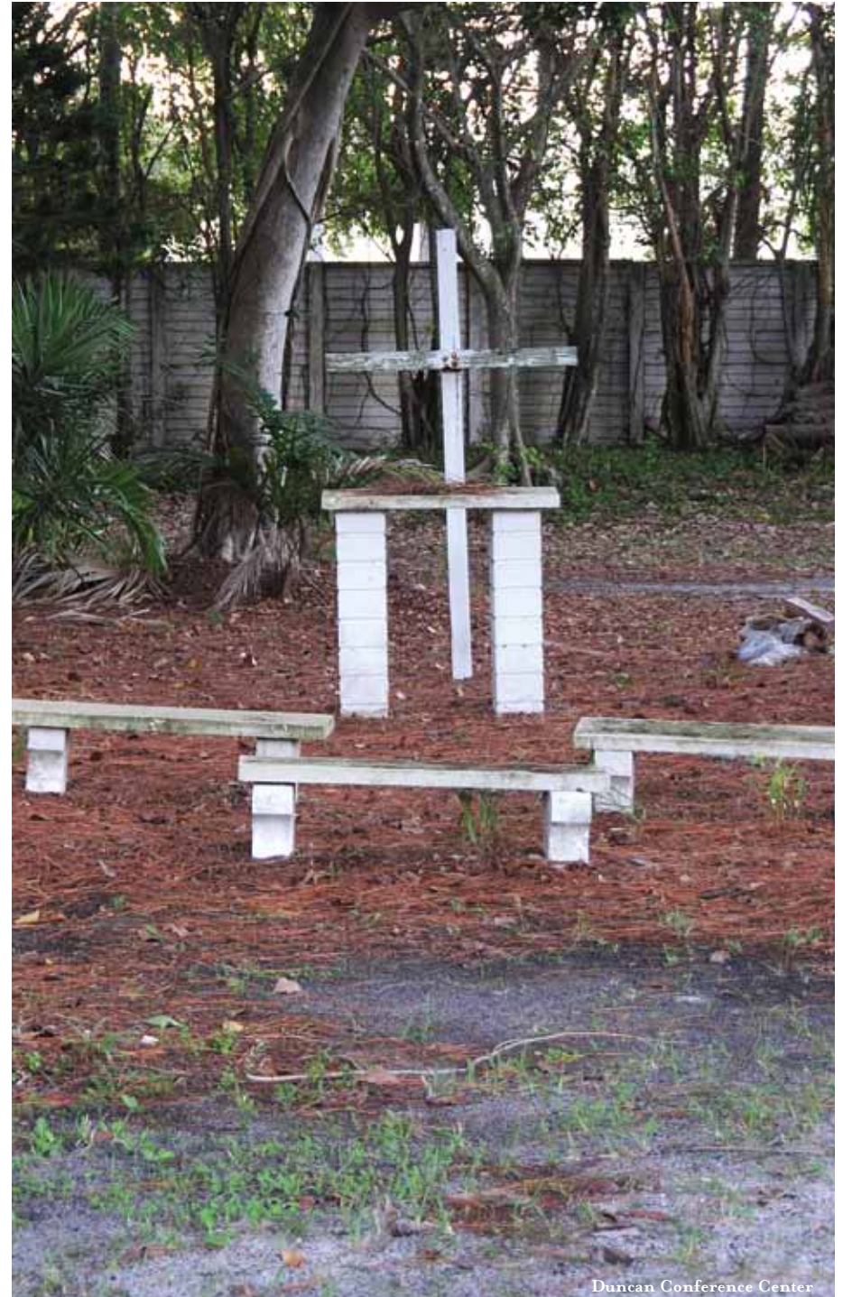
Duncan Conference Center